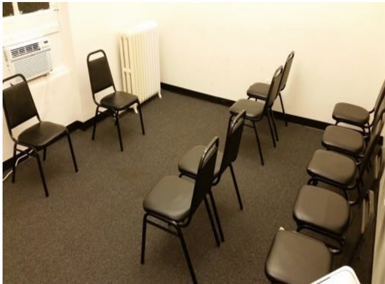
This is a photo of Classroom E $15.00 an hour ($20.00 an hour 'Peak')

Classrooms E & F - These are our smaller classrooms, ideal for writing sessions, smaller improv group rehearsals or coaching sessions. Classroom F is approximately 16' x 12'. Classroom E is smaller, approximately 12' x 12'. Each is equipped with 1 folding table enough chairs for its maximum capacity of 12 people.