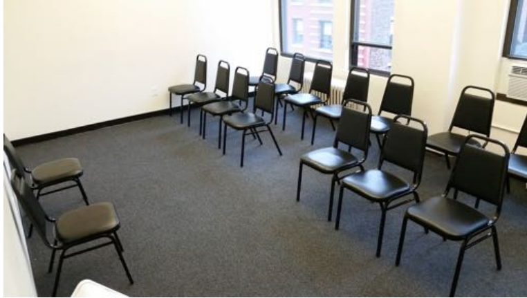
This is a photo of Classroom J $15.00 an hour ($25.00 an hour 'Peak')